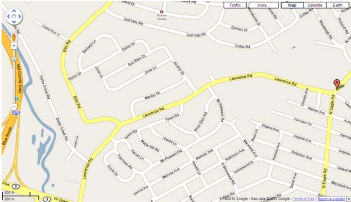
Illustration 5. Google Map