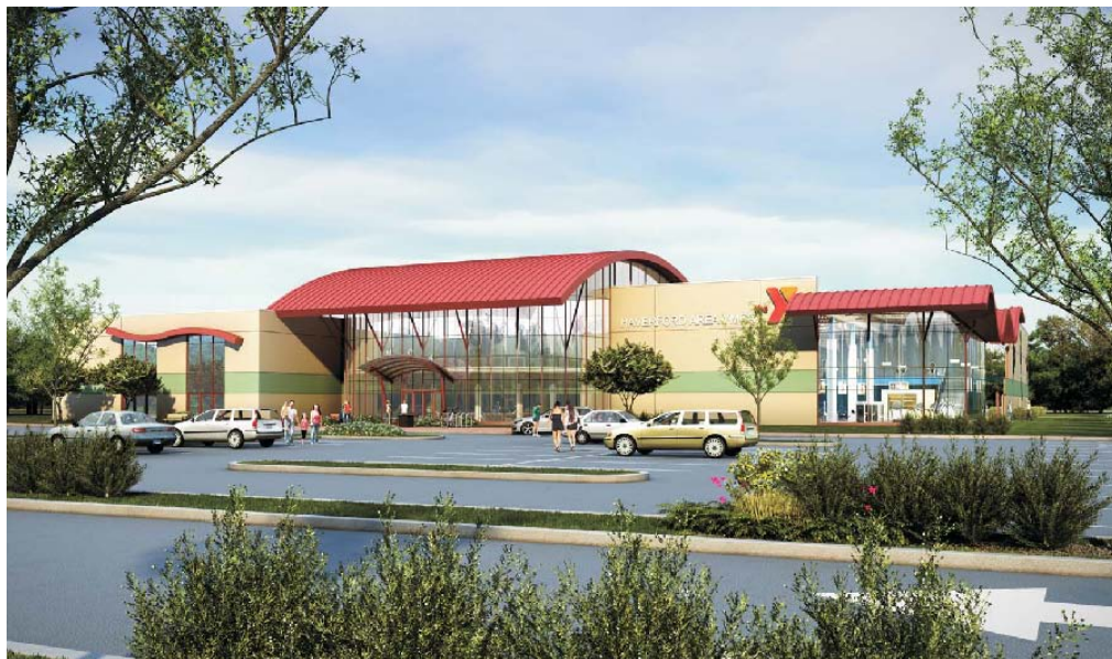
Illustration 1. Artist Rendering of the new Haverford Township Area YMCA

While there are for-profit fitness facilities in the area, they do not provide appropriate programs for preschoolers, teens and families. The YMCA provides an environment where all health seekers are comfortable and can work toward personal goals. The YMCA helps build relationships between members, staff and community stakeholders. Additionally, this YMCA will provide an aquatic experience for virtually everyone. From swim lessons, lap swim for general health and wellness, water exercise classes and senior programs, this YMCA will be positioned to provide an essential service to local residents, which currently does not exist.