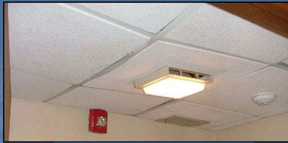
Prisoner's Restroom Ceiling