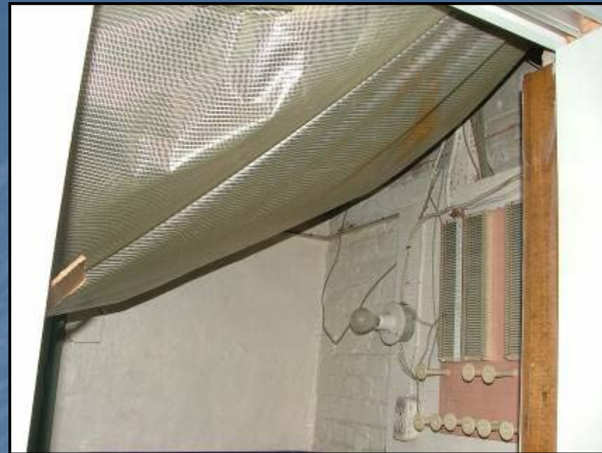
Investigations Records Storage Room