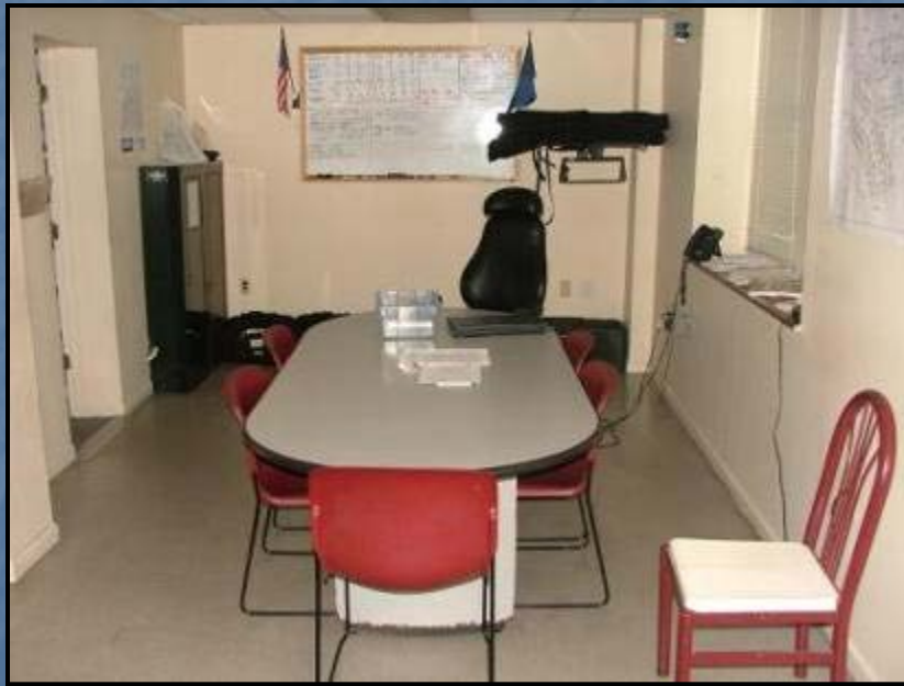
Patrol Officer Report Room and Roll Call Room (40 Officers)