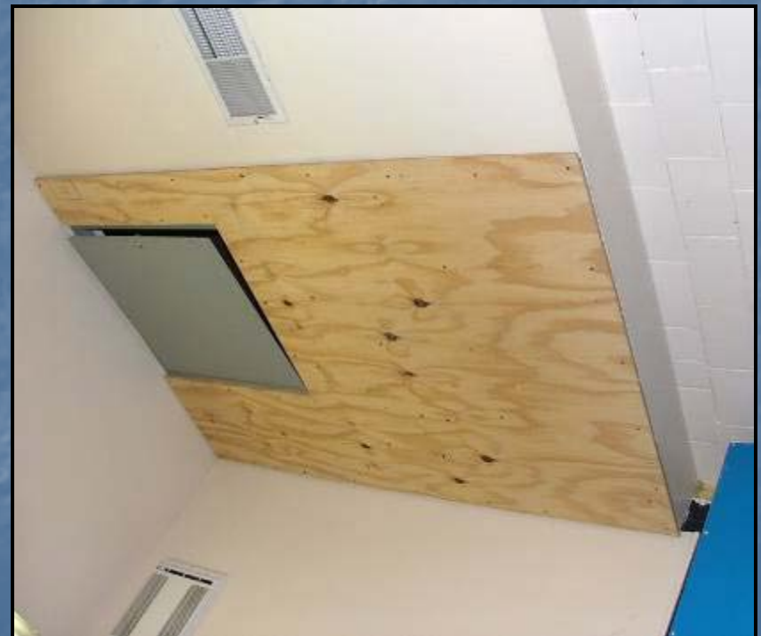
Entrance to Building Loft in Prisoner's Cell