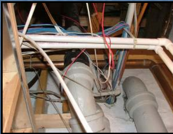
Custodian Supply and Generator Room