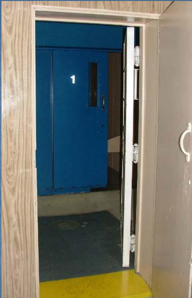
Prisoner's Cell Entrance