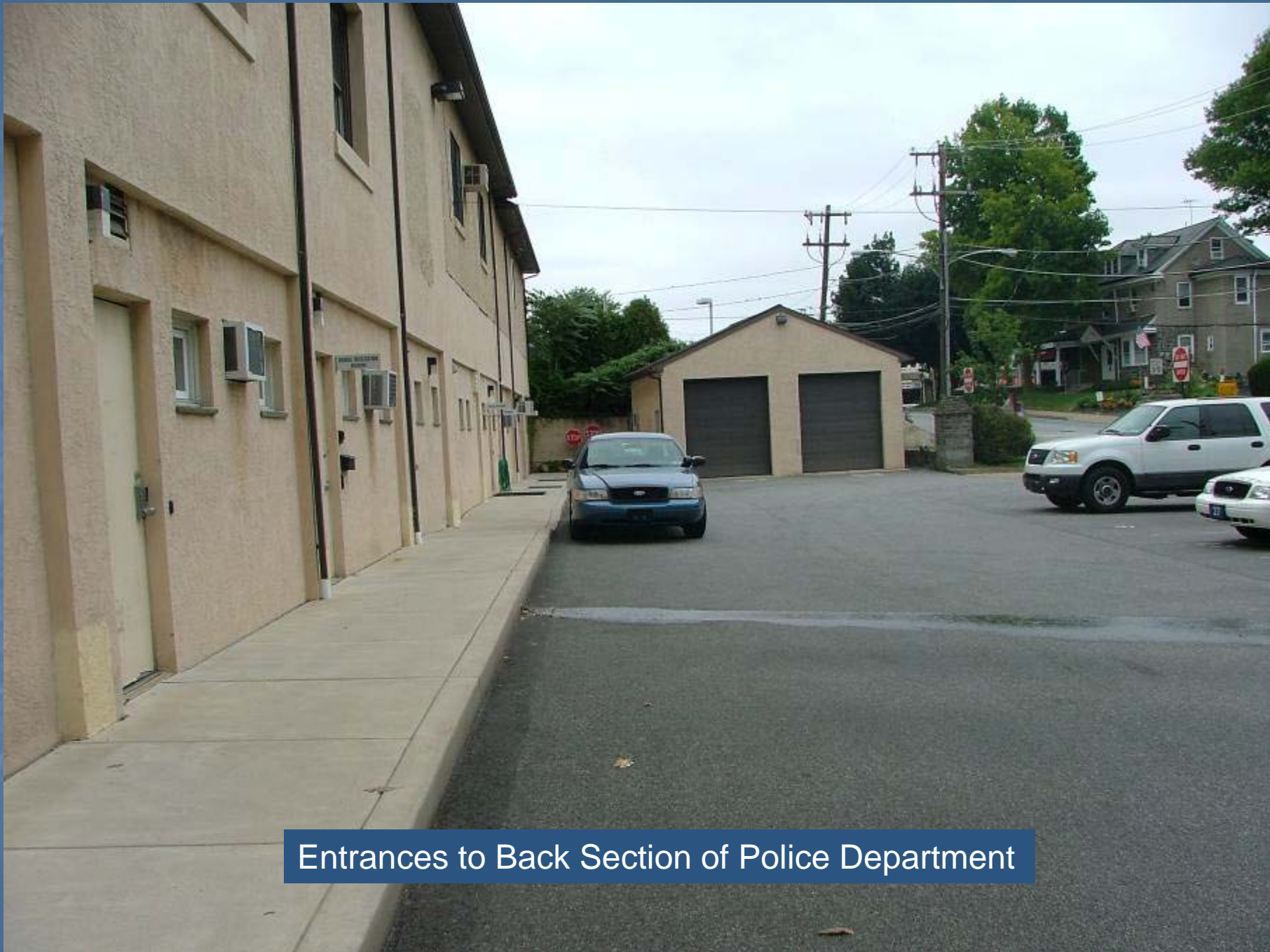
Entrances to Back Section of Police Department